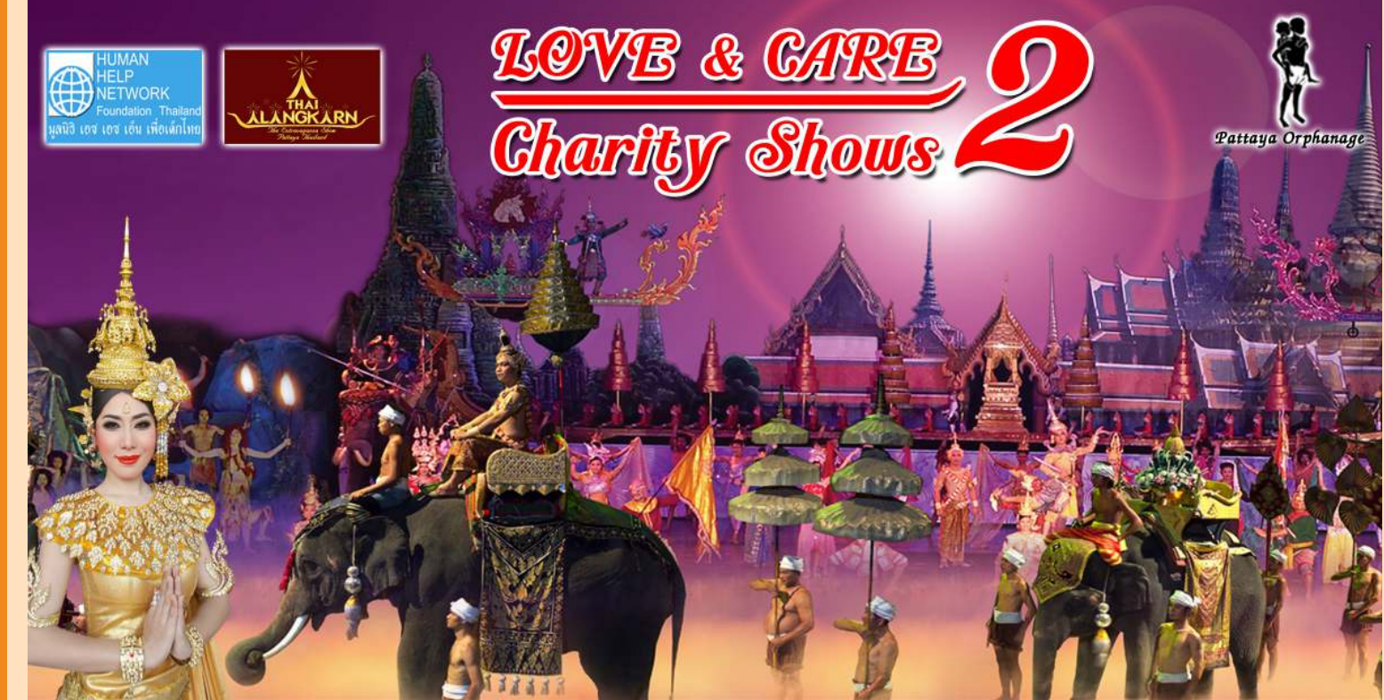
Support Pattaya Orphanage children and their education, join the annual Charity Event at Thai Alangkarn Theatre.. Enjoy Thai unique, traditional, and cultural shows by our talented children, To Be No. 1 Group, and Alangkarn Theatre. Date: Saturday 17<sup>th</sup> October 2015 Time: 14:00-16:00 hrs. Ticket: 1,000 Baht.